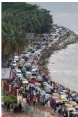
Persons in Conakry, Guinea waiting to be seen by Mercy Ships staff, August 2012